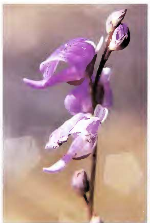
central highlands, Antananarivo.